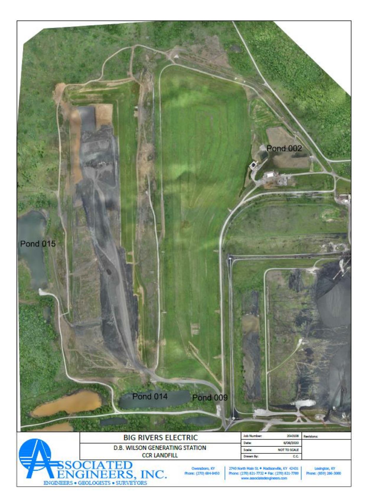
Attachment A - Aerial Photo of the D.B. Wilson CCR Landfill