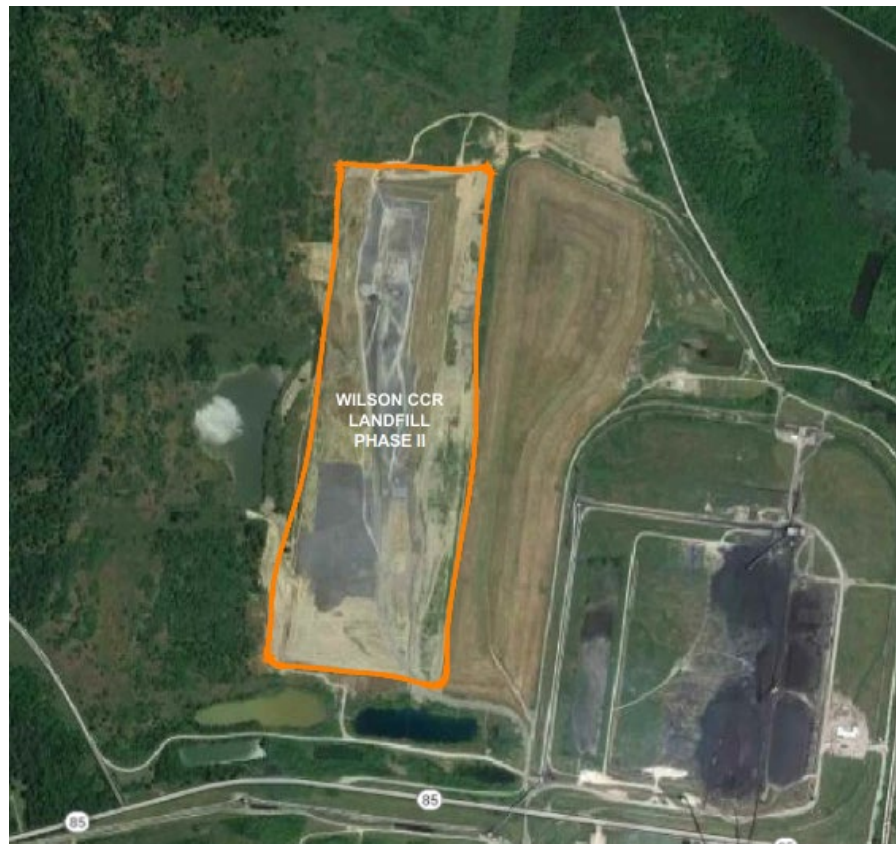
Figure 1: D.B. Wilson Phase II CCR Landfill Aerial Photograph

Changes to the landfill geometry since the previous 2017 annual inspection includes placement of additional CCR, protective cover soils and establishing vegetation on the landfill.